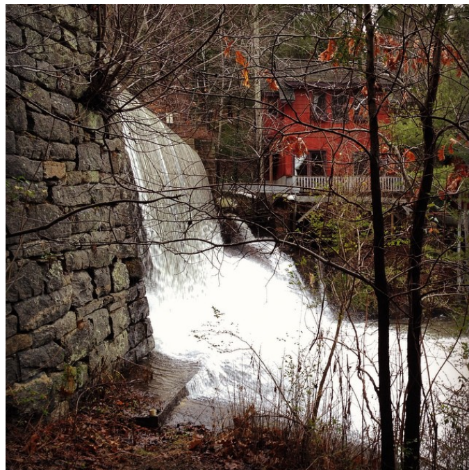
Highland Lake Dam – Flat Rock, NC