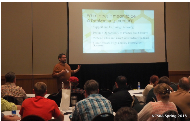
"After the Bee School: Mentoring New Beekeepers" at NCSBA